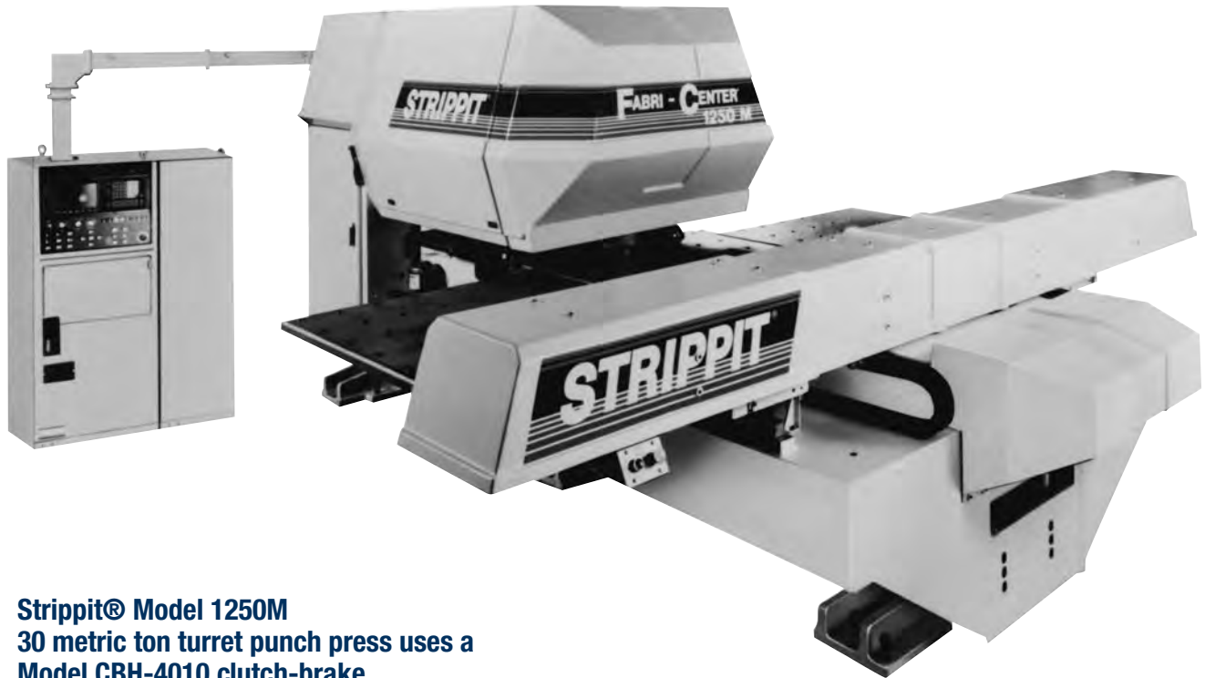
Strippit® Model 1250M 30 metric ton turret punch press uses a Model CBH-4010 clutch-brake