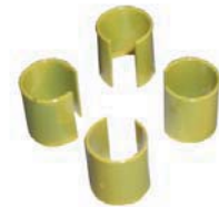
2000 RPM Spring (optional)