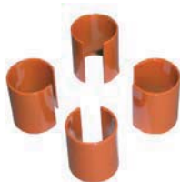
1800 RPM Spring