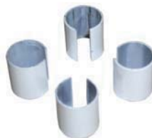
2300 RPM Spring