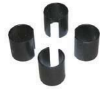
3000 RPM Spring (optional)