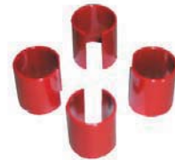
1200 RPM Spring (optional)