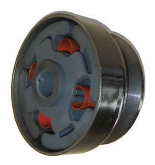
Precise and durable motion control solutions